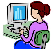
Sherrie Moore, webmaster